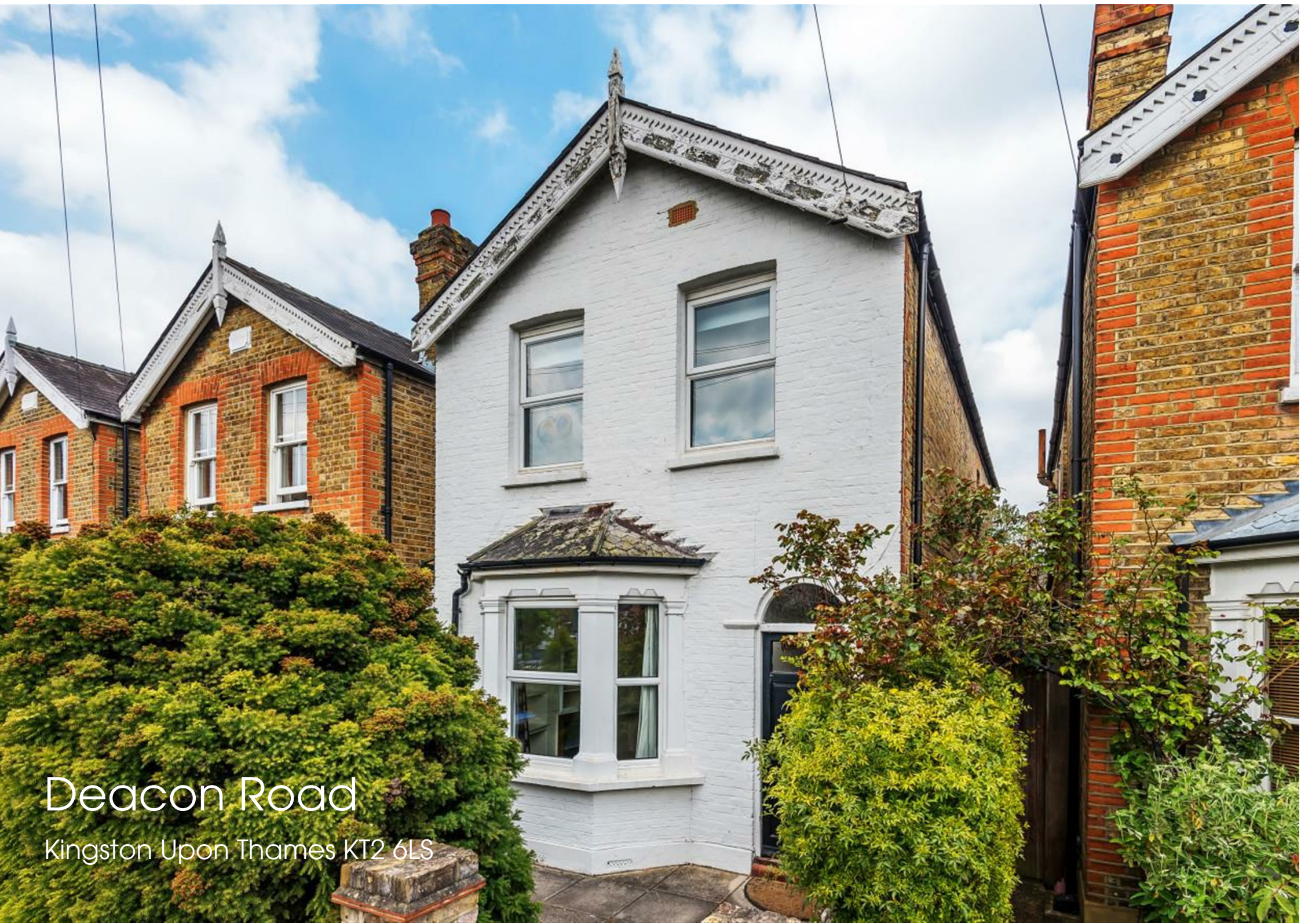
Deacon Road Kingston Upon Thames KT2 6LS